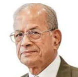
2019 Dr. E. Sreedharan Principal Adviser and Former Managing Director Delhi Metro Rail Corporation.