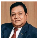
2024 Shri Anil Manibhai Naik Chairman Emeritus Larsen & Toubro Ltd