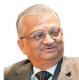
2023 Dr. Anil Kakodkar Former Chairman Atomic Energy Commission & Secretary to Government of India, Department of Atomic Energy