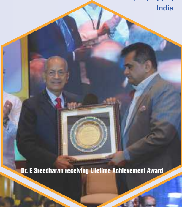
Dr. E Sreedharan receiving Lifetime Achievement Award

Indian Member of PMA | IPMA ® India | international project management association