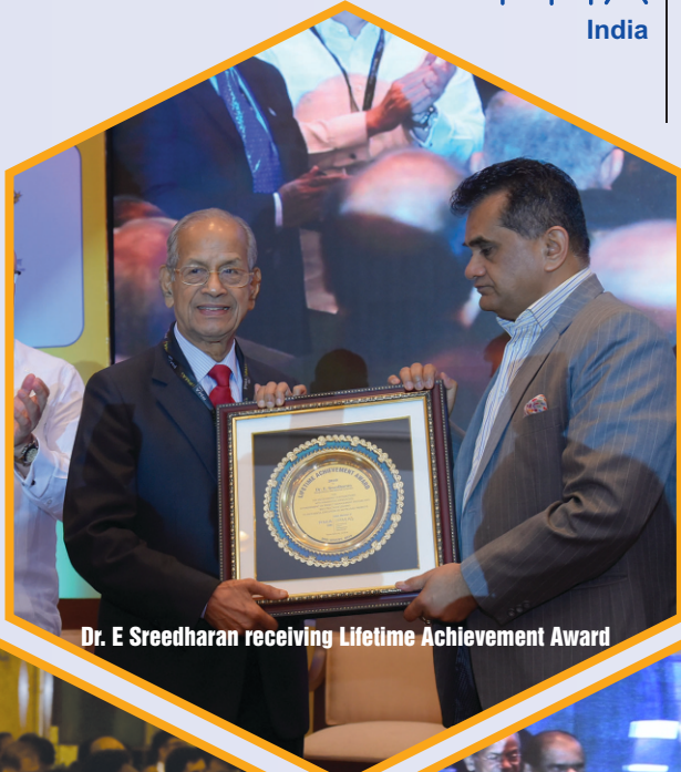
Dr. E Sreedharan receiving Lifetime Achievement Award

Indian Member of PMA | IPMA ® India | international project management association